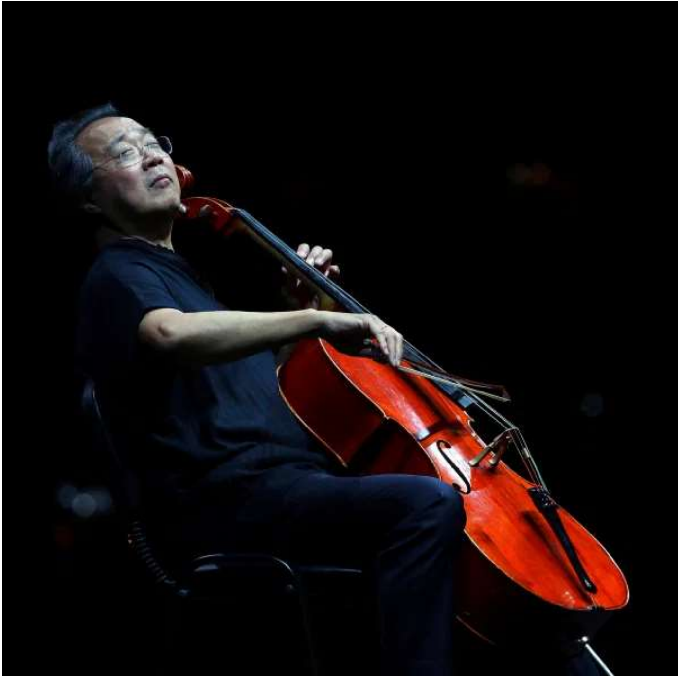
Yo-Yo Ma: The Pathway to a Better World Begins With Culture