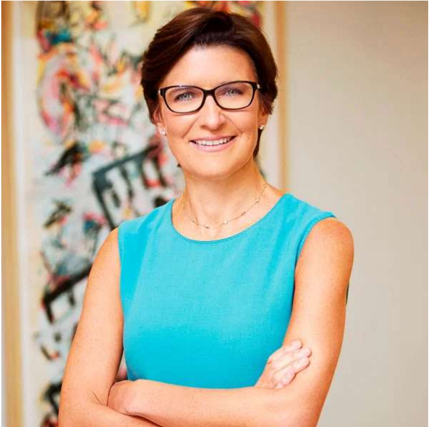
Jane Fraser, The Incoming CEO of Citigroup, On How to Smash the Glass Ceiling