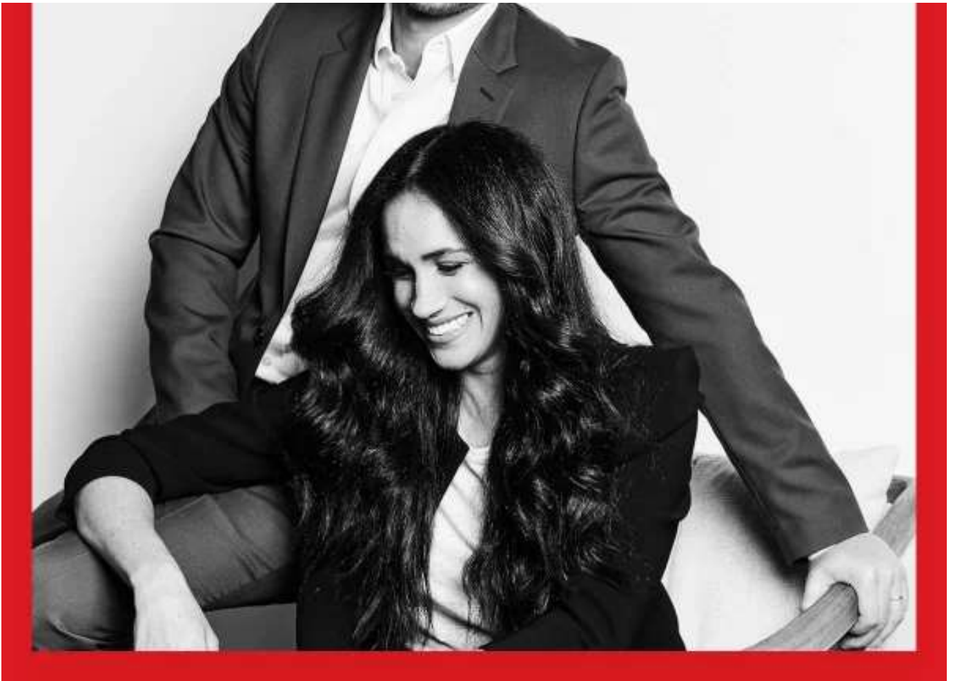
'This Is a Global Crisis.' Prince Harry and Meghan, the Duke and Duchess of Sussex, Discuss the State of the Digital World